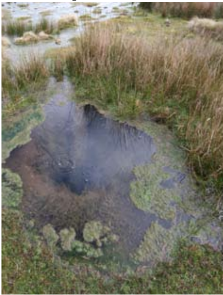
Alpine mound spring at the Vale of Belvoir