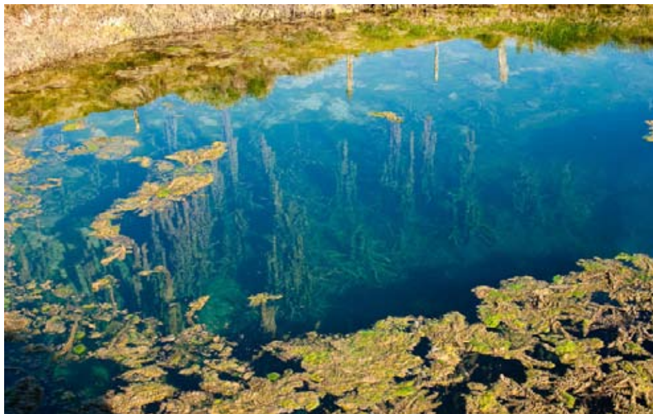
Wetland at the Vale of Belvoir