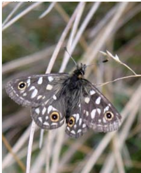
Male Ptunnara brown butterfly

summer searching for threatened plants, such as the rare Tadgell's leek orchid ( Prasophyllum tadgellianum ), the nationally endangered grassland paperdaisy ( Leucochrysum albicans var. tricolor ) and the vulnerable alpine candles ( Stackhousia pulvinaris ). Data collected from these surveys have been captured in a database and electronically mapped, allowing our reserves managers to more thoroughly plan management activities such as grazing and burning.