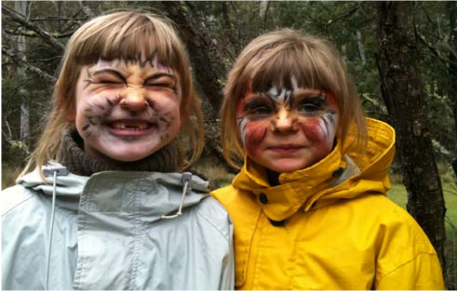
Wild animals, Sienna and Alma, seen at the TLC 10th anniversary family day