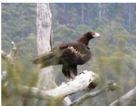
Aquila audax fleayi (Wedge-tailed eagle)

The TLC's delivery of Tasmania's component of the woodland bird program has been an outstanding success. This national program, funded through a Caring for our Country grant, aimed to protect habitat for woodland birds declining across south-eastern Australia. In Tasmania, nine private landholders entered into a permanent covenant to protect their properties for the Swift parrot, Forty-spotted pardalote and a host of other woodland beauties like the Flame and Scarlet robins, Painted button quail and Spotted quail thrush.