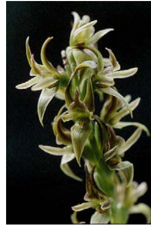
Prasophyllum pulchellum & Prasophyllum limnetes