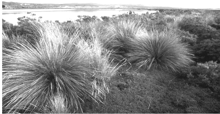
Silver Tussock grasses on Long Point