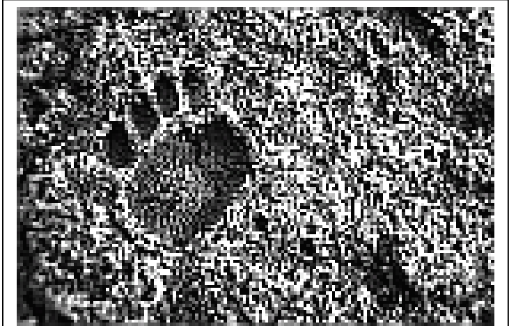
Devil Print