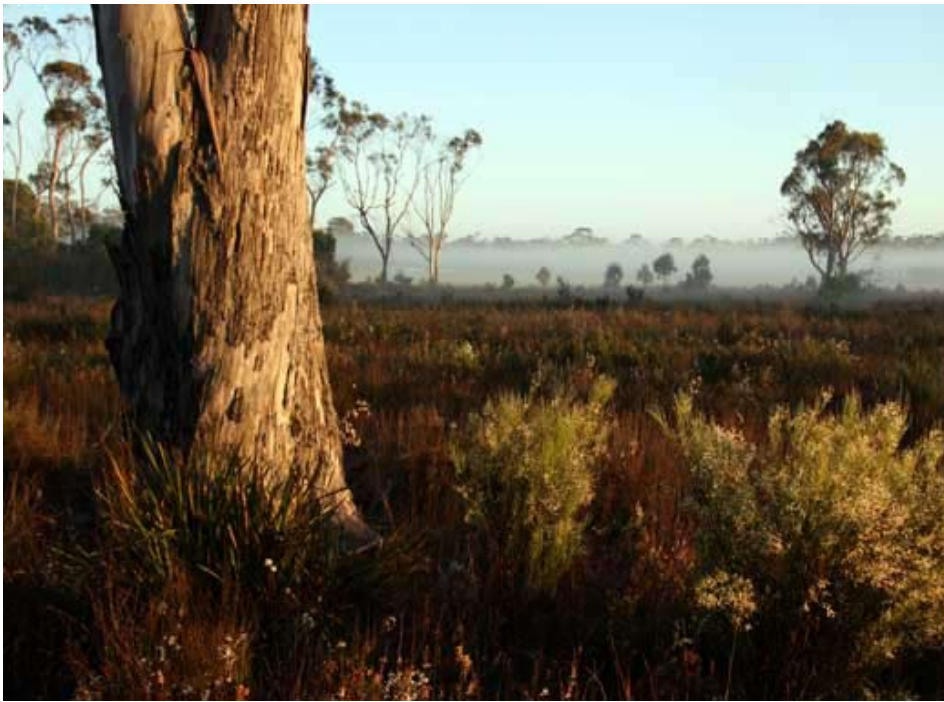
Endangered black gum woodland and rare orchid habitat of Rubicon Sanctuary