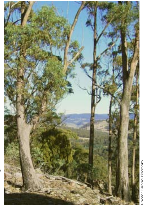
Snows Hill Reserve, Colebrook