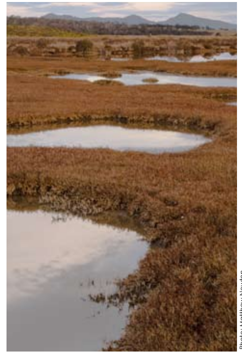
Long Point Reserve