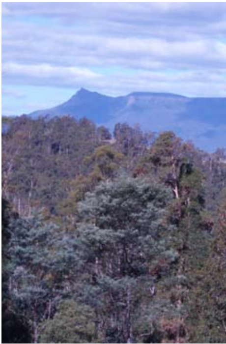
Sassafras Creek Reserve, Mole Creek