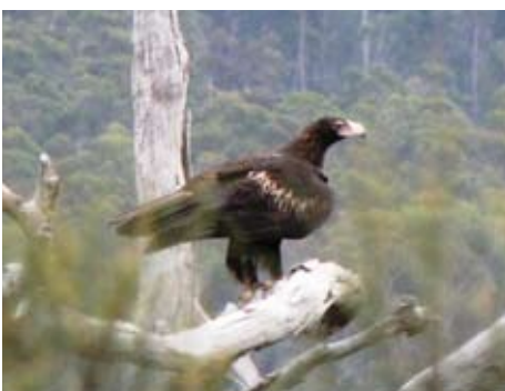
Aquila audax fleayi (Wedge-tailed eagle)