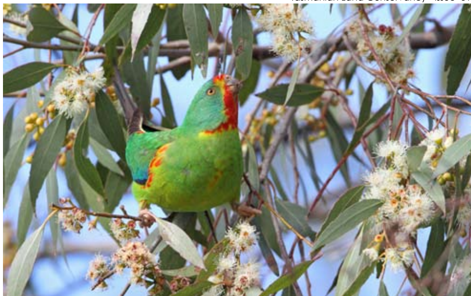
Lathamus discolor (Swift parrot)