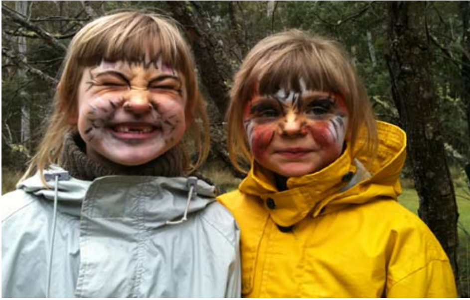
Wild animals, Sienna and Alma, seen at the TLC 10th anniversary family day