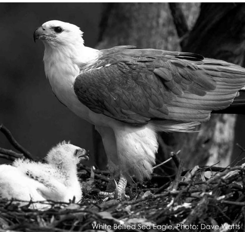
White Bellied Sea Eagle

Tasmania has two eagle species - the Tasmanian wedge tailed eagle and the White bellied sea eagle. Both species are threatened; the Wedge tailed eagle is considered endangered while the sea eagle is listed as vulnerable. Most of the sea eagles prefer coastal habitat while Wedge tailed eagles prefer inland sites.