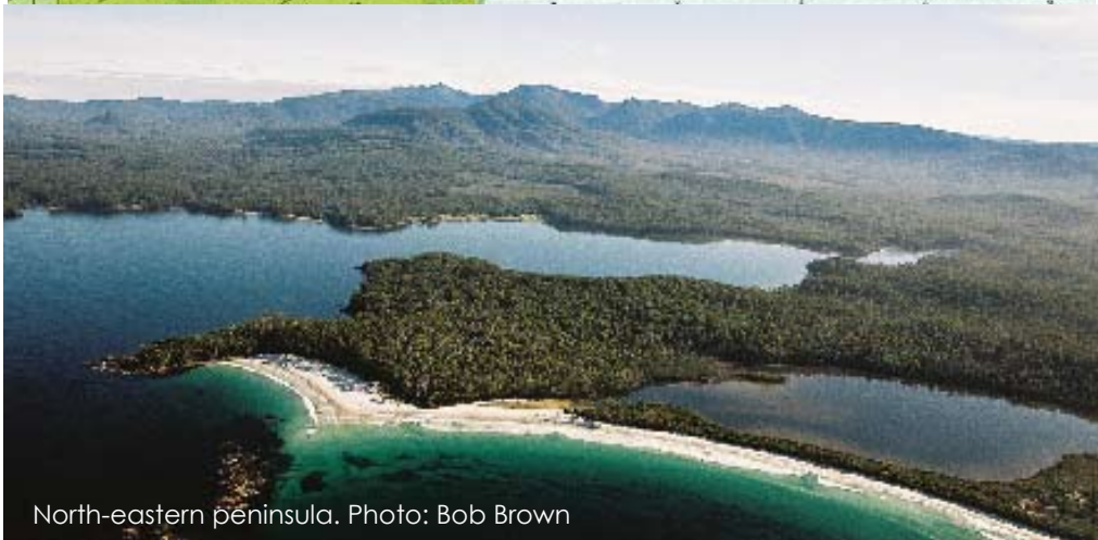
North-eastern peninsula.