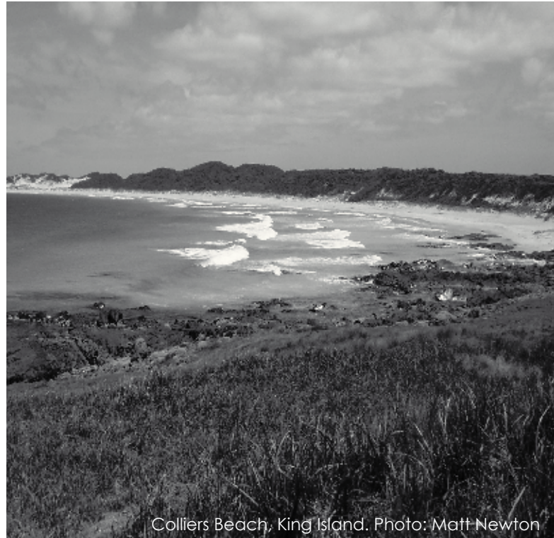
Colliers Beach, King Island.

If you know of anyone looking for land in the north of the State, please encourage them to consider this amazing 19 ha property with 9 threatened species and 36 species of native orchid.