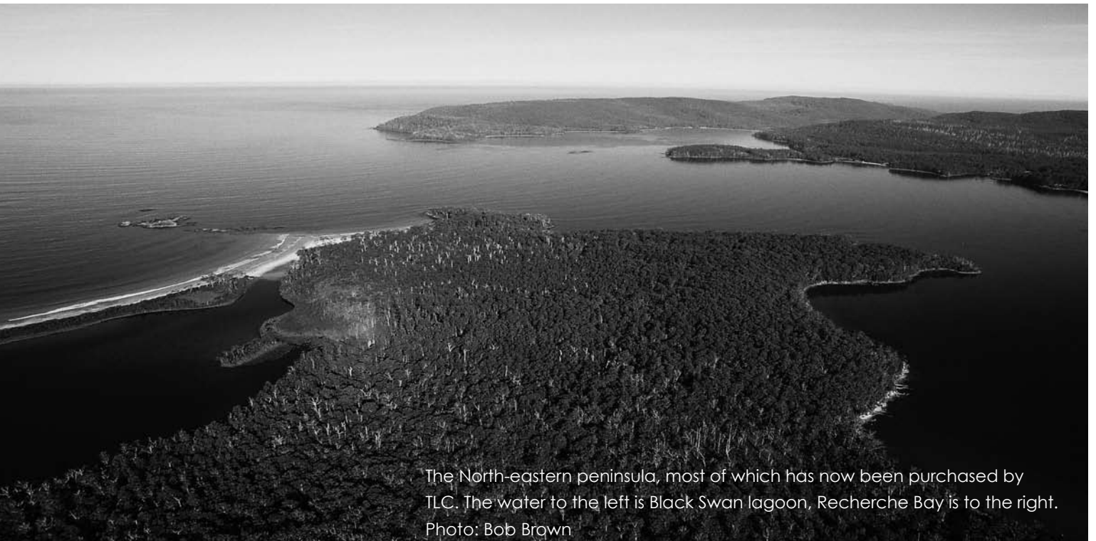
The North-eastern peninsula, most of which has now been purchased by TLC. The water to the left is Black Swan lagoon, Recherche Bay is to the right.