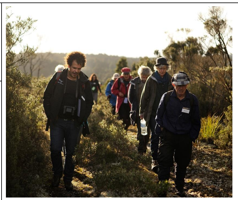
The Blue Tier open day

TLC hosted an open day and supported one scientific research project