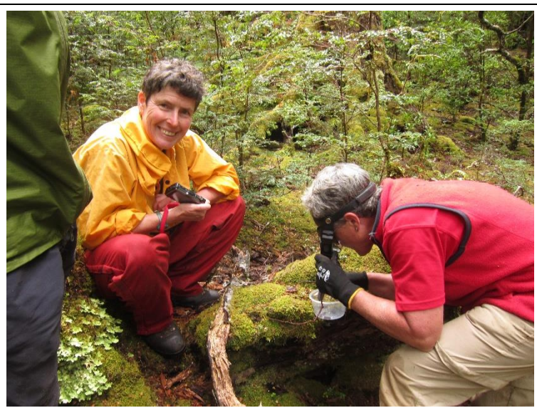
TLC volunteers surveying the Reserve for Simson's stag beetle

The Reserve's natural values are presented to the community (ongoing)