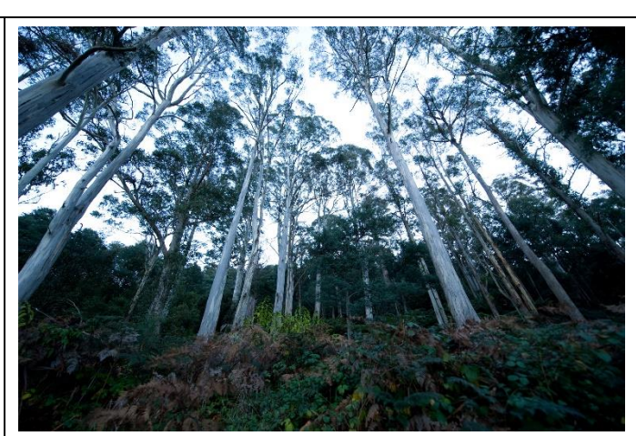
Tall eucalypt forest