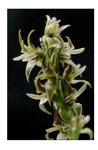
Prasophyllum pulchellum & Prasophyllum limnetes