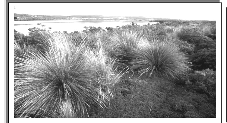
Silver Tussock grasses on Long Point