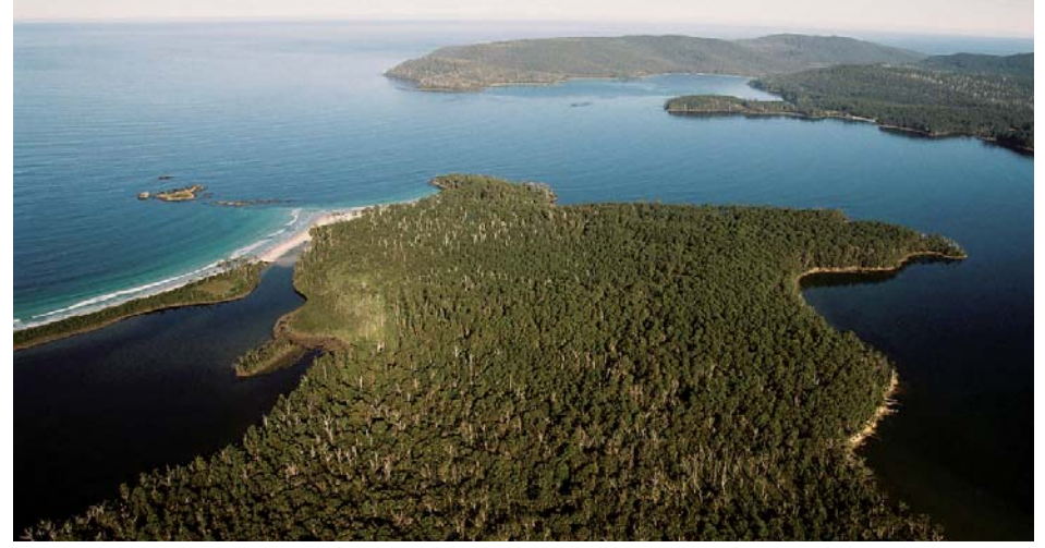
Recherche Bay