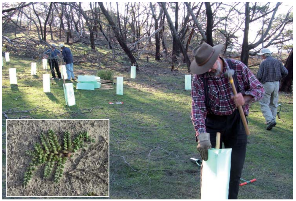
Volunteers at Long Point, and Insert: Wilsonia rotundifolia, a newly discovered threatened species