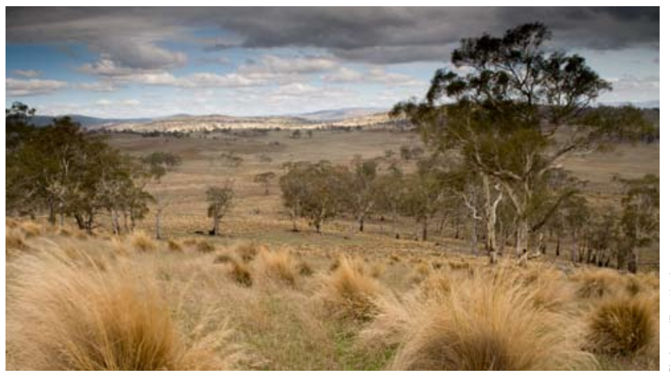
Ross landscape, Tasmanian midlands