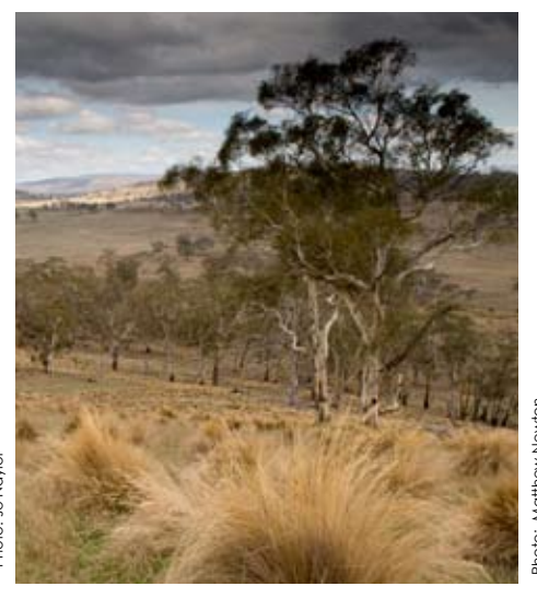
Ross landscape, Tasmanian midlands

Spaces are limited to 15 supporters. If you would like to be included please contact us on 03 6225 1399 or email jnaylor@tasland.org.au to register.