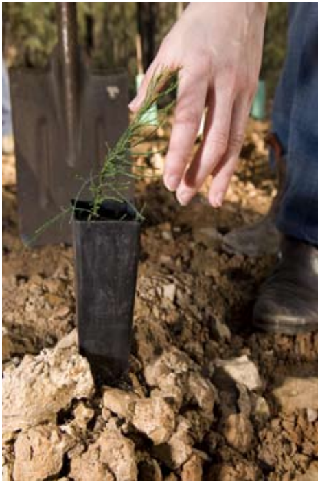
Tree planting at Flat Rock Reserve