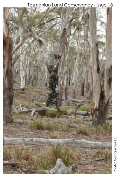
Grassy white gum forest