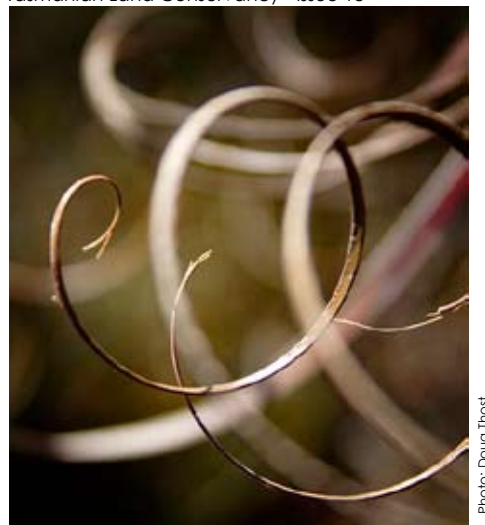
Pandani Detail #1