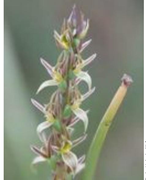
Golfers leek-orchid (Prasophyllum incorrectum)