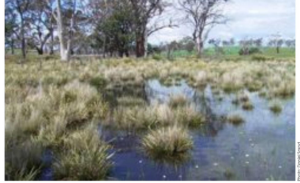
Ephemeral wetland on Wetmore in the heart of the midlands