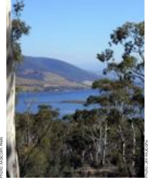
FOR SALE - Risdon Peppermint, near Hobart

If you represent a community group or are a community-minded individual and require a facility for meetings, workshops or exhibitions, please contact us if you would like to use our Gallery meeting room at 827 Sandy Bay Rd.