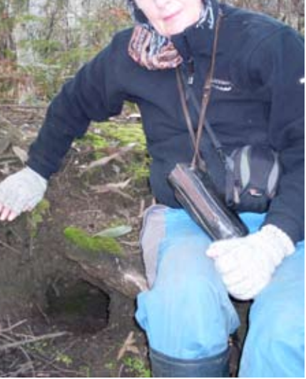
Long Point - a TLC permanent reserve