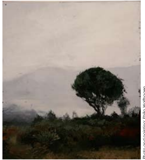
Tasmanian Land Conservancy - Issue 22