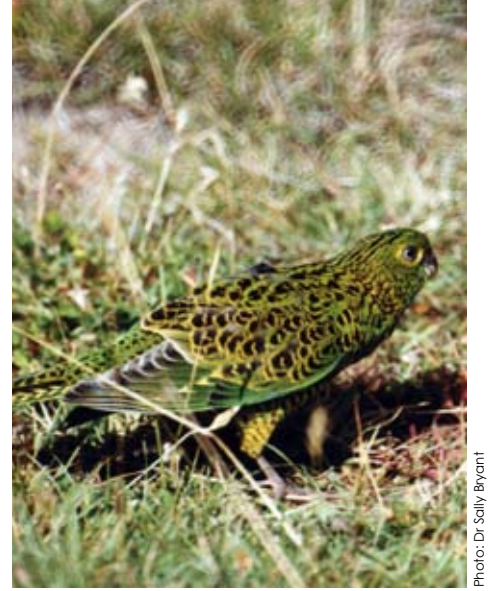
Ground parrot - a resident of the Vale of Belvoi