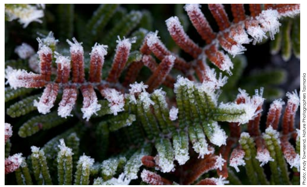
Skullbone Plains flora on a crisp April morning