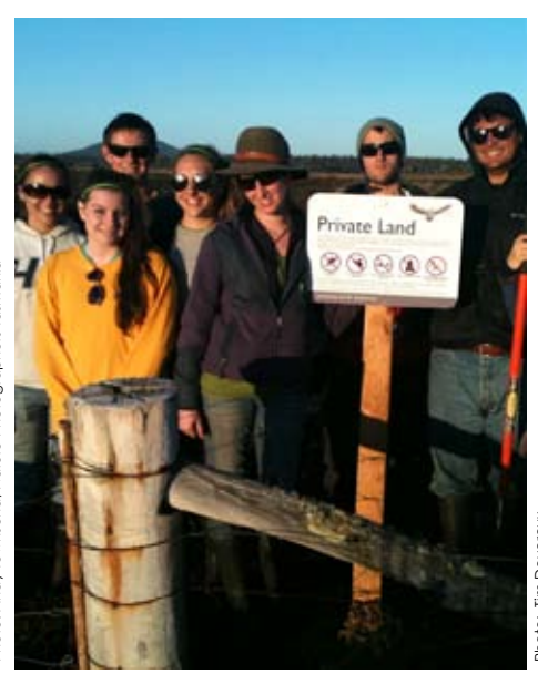
International student volunteers at Long Point