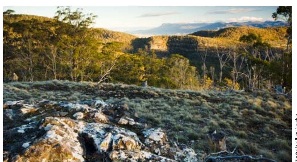
TLC Flat Rock reserve adjoining the Chauncy Vale Wildlife Sanctuary, southern midlands