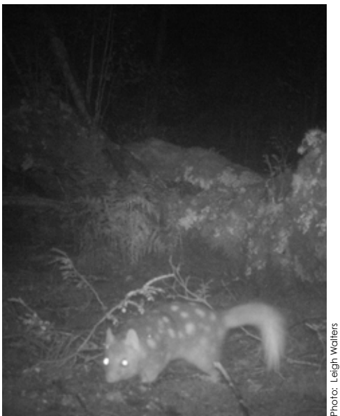
Eastern quoll (Dasyurus viverrinus) at TLC's Blue Tier Reserve Continued

of the Tasmanian devil and wedge-tailed eagle across New Leaf properties.