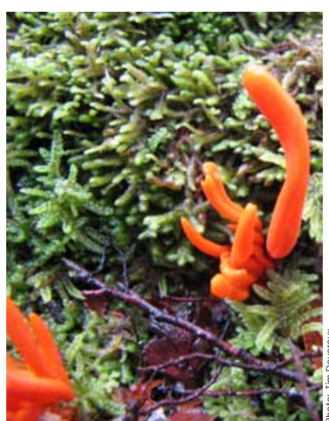
Coral fungus (Clavaria miniata) in TLC's Blue Tier Reserve