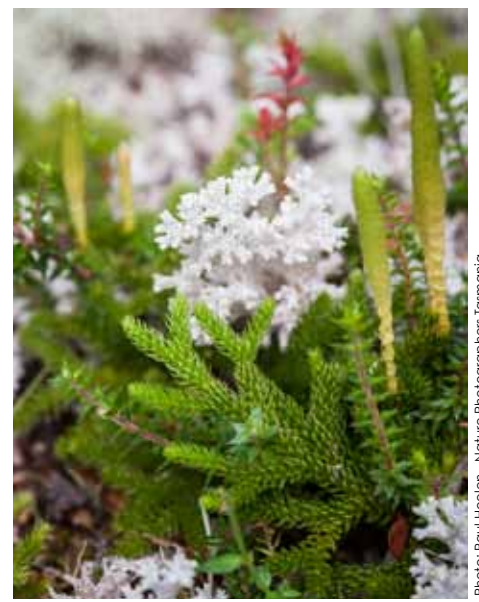
Coral lichens and moss at TLC's Blue Tier Reserve