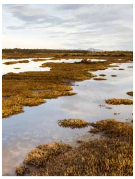
Long Point saltmarsh overlooked by The Hazzards in the distance