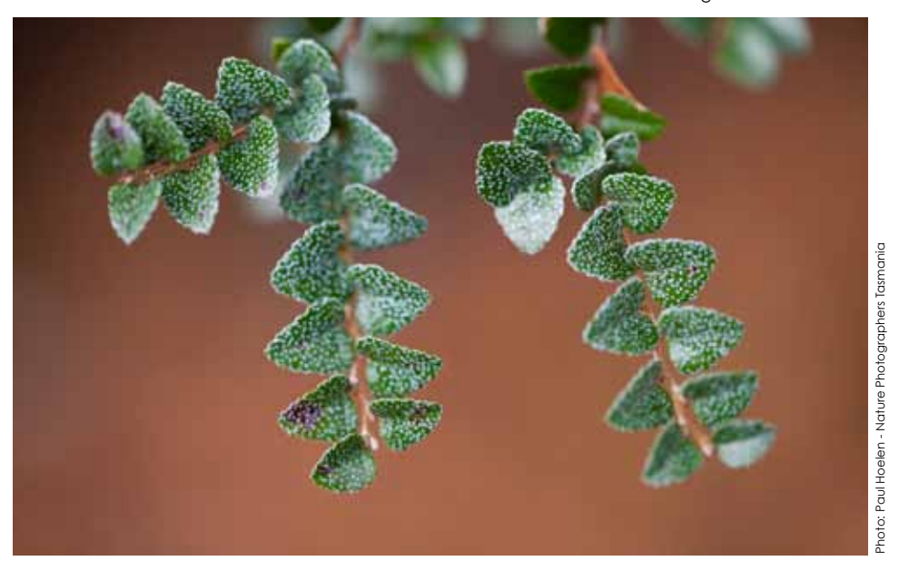
Myrtle beech (Nothofagus cunninghamii) in TLC's Blue Tier Reserve