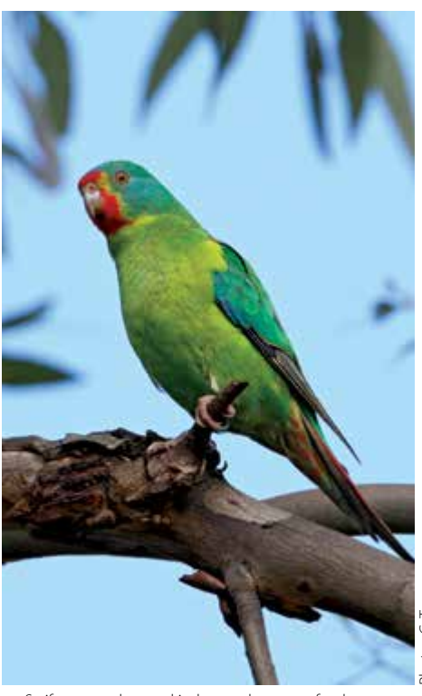
Swift parrot who was kind enough to pose for the camera