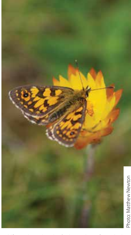
Wildflower day at the Vale of Belvoir - a butterfly perched on an orange everlasting (Xerochrysum subundulatum)

Members from the Australian Plant Society and the Hobart Photographic Society freely explored the Vale and took some spectacular shots despite the heavy mist.