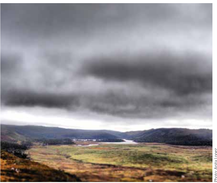
View of the Vale and Lake Lea from Black Bluff Lookout, Vale of Belvoir