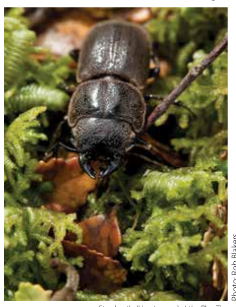
Stag beetle (Lissotes spp.) at the Blue Tier