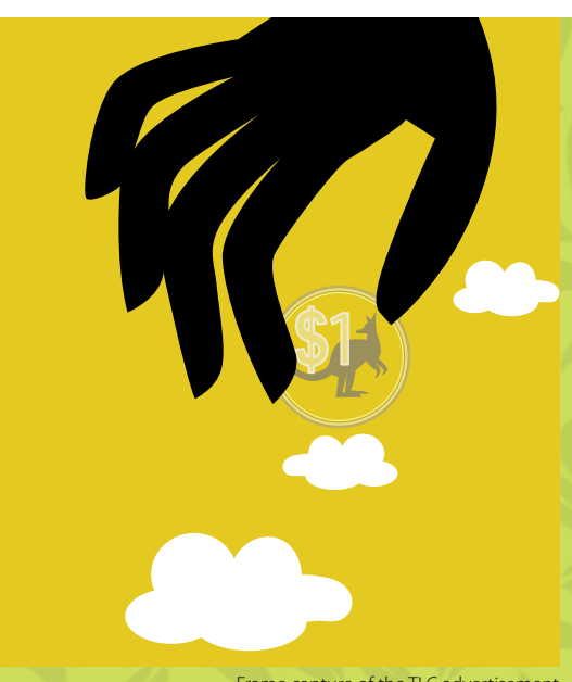
Frame capture of the TLC advertisement