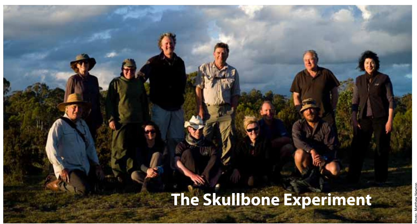
The artists at Skullbone Plains