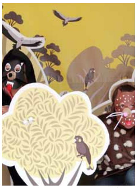
Masked participants in the TLCs "natural habitat" setting