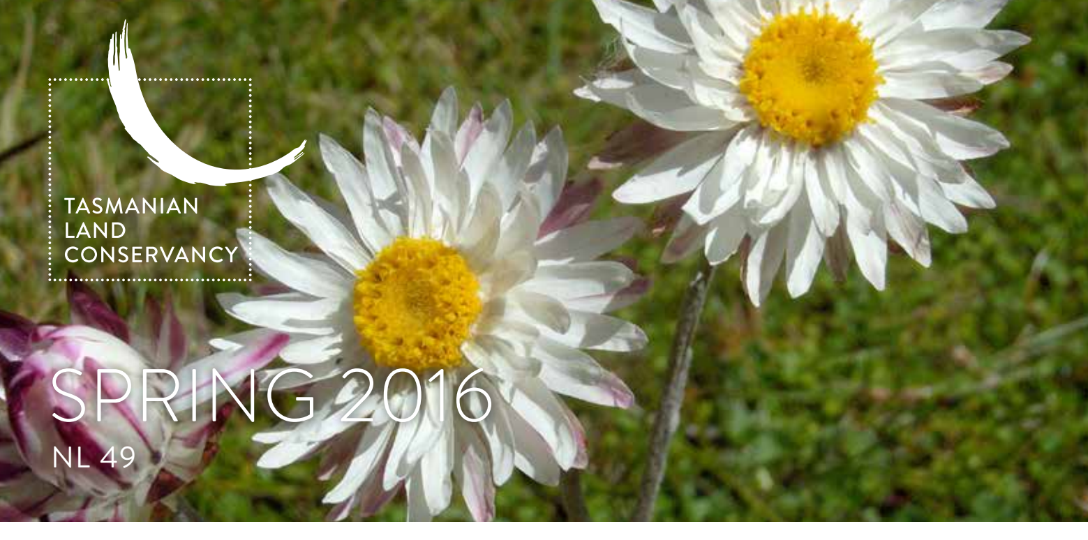
Grassland paperdaisy (Leucochrysum albicans var. tricolor).

Thank you to everyone who has so generously contributed to our new Daisy Dell fundraising effort. There is something so wonderful about this property that makes us at the TLC really excited. The strong sense of connection and commitment to this land expressed by the neighbouring land holders gives us a hint of the importance of this place.