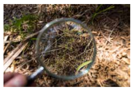
Taking close look at nature.

Page 2 Find out about our new efforts to protect Daisy Dell, a highland property with a host of threatened and rare flora.