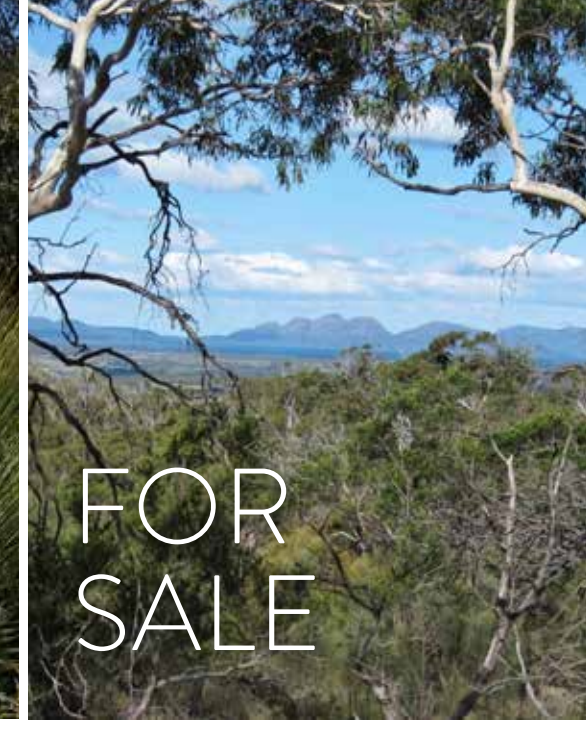
The view towards from the Bluemans Run Revolving Property.

As always we thank everyone who made the day so successful, including the volunteers who helped in the running of the event and who spent the days prior clearing the foreshore of flotsam and old beer bottles. We give our profound thanks to the wonderful presenters and guides who shared their immense expertise, and all you who helped protect Panatana.