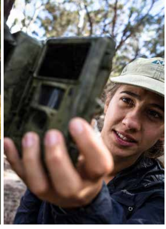
Setting up monitoring cameras at The Big Punchbowl.