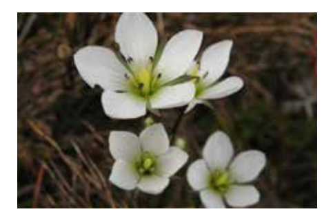
Tasmanian snowgentian (Gentianella diemensis).

Page 2 Find out about our new efforts to protect Daisy Dell, a highland property with a host of threatened and rare flora.