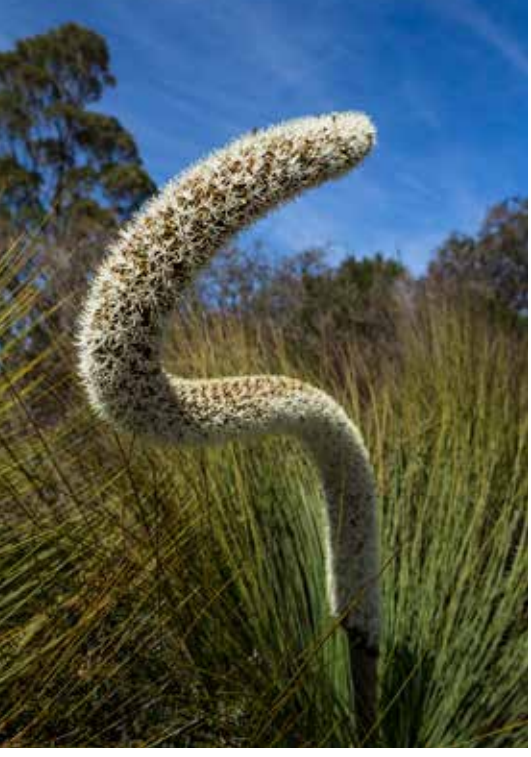
Xanthorea (Xanthorroea australis) in full bloom at Panatana.

THURSDAY 15 DEC 1.00pm: Waterworks Reserve, Hobart, Site 8. For catering purposes, please register at tlcxmasbbq2016.eventbrite.com.au by Sunday 11 December.