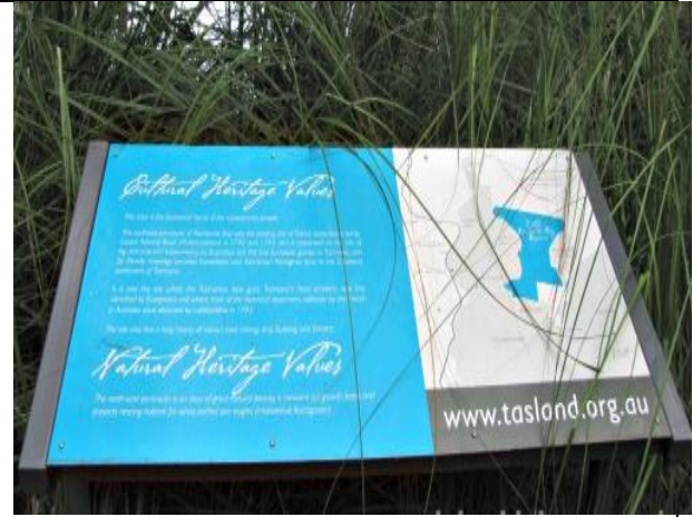
TLCs Rechereche Bay Reserve sign at Moss Glen.

A significant area of the Reserve is listed under State and National Heritage Registers for its important cultural heritage values. The most pertinent of these values include the French exploration in 1792 and 1793 led by Bruni D'Entrecasteaux, involving botanical collections, astronomical observations, the planting of a vegetable garden and peaceful contact with Aboriginal people. Other values include extensive use of the land for convict coalmining, whaling, ship building, timber harvesting and milling.