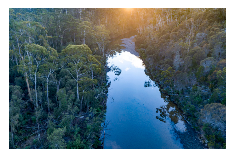
Little Swanport River.