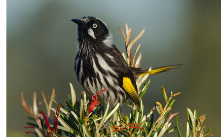
New Holland honeyeater ( Phylidonyris novaehollandiae ).

Read about the latest Discovery Day enjoyed by TLC supporters at Daisy Dell Reserve near Cradle Valley.