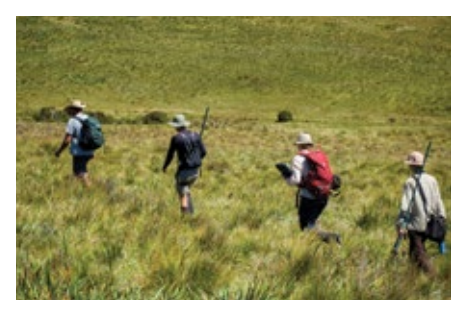
Ecological monitoring at the Vale.

While providing essential habitat for threatened species, Tinderbox Hills also holds many memories for the Hale family.