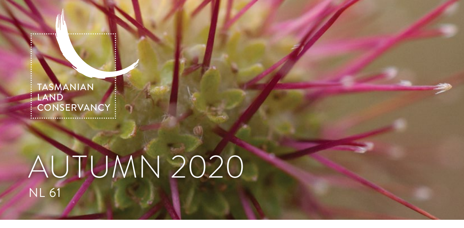
Buzzy (Acaena novae-zelandiae) at Blue Tier.

It has been a busy start to 2020 for the Tasmanian Land Conservancy (TLC), with our field season for the Reserve Management and Science teams in full swing. Now in its ninth consecutive year, the annual Central Highlands weeding program has yet again delivered significant results. The team is seeing marked declines in invasive species across our highland estate, with volunteers coming from far and wide to contribute. Thanks to all our volunteers, many returning for another year to maintain our efforts. We are always inspired to hear of our volunteers' motivations for protecting nature and we have a story in this newsletter that I think is a first for the TLC.