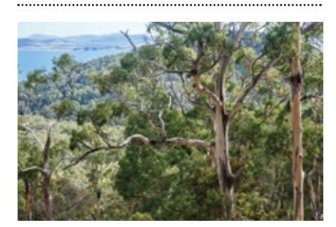
Mt Communication.