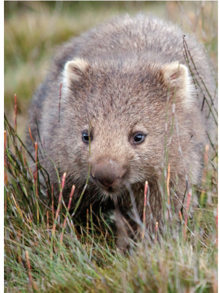
Common wombat ( Vombatus ursinus )

The objects and purposes which already bind the TLC provide a framework for the use of all funds and property we receive. Our focus on the perpetual protection and ongoing management of land of exceptional ecological value gives our supporters peace