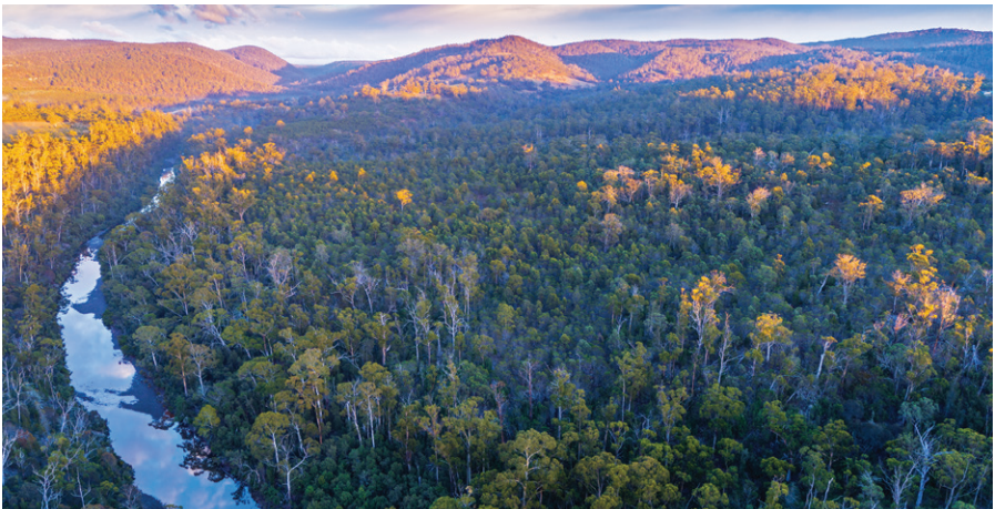
TLC's Little Swanport Reserve.

..... Read about Little Swanport and the TLC's suite of reserves at www.tasland.org.au/reserves