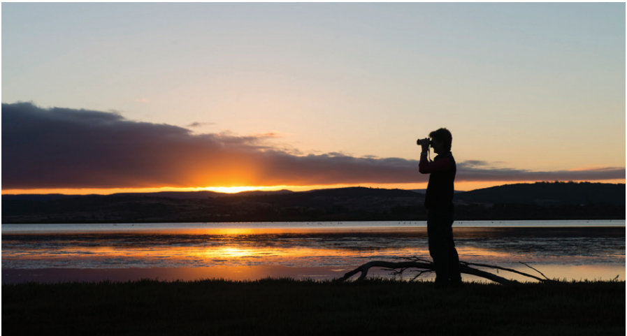
Natural Guardian Sally Bryant at the TLC's Big Punchbowl Reserve. Opposite: TLC's Lutregala Marsh Reserve.

People connect to nature in so many different ways. Leaving a gift in your will is something simple and powerful you can do to make sure the wild places you love today are protected for the future.