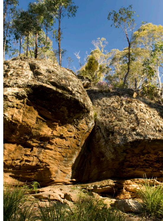
Cave shelter, Bullock Hills.