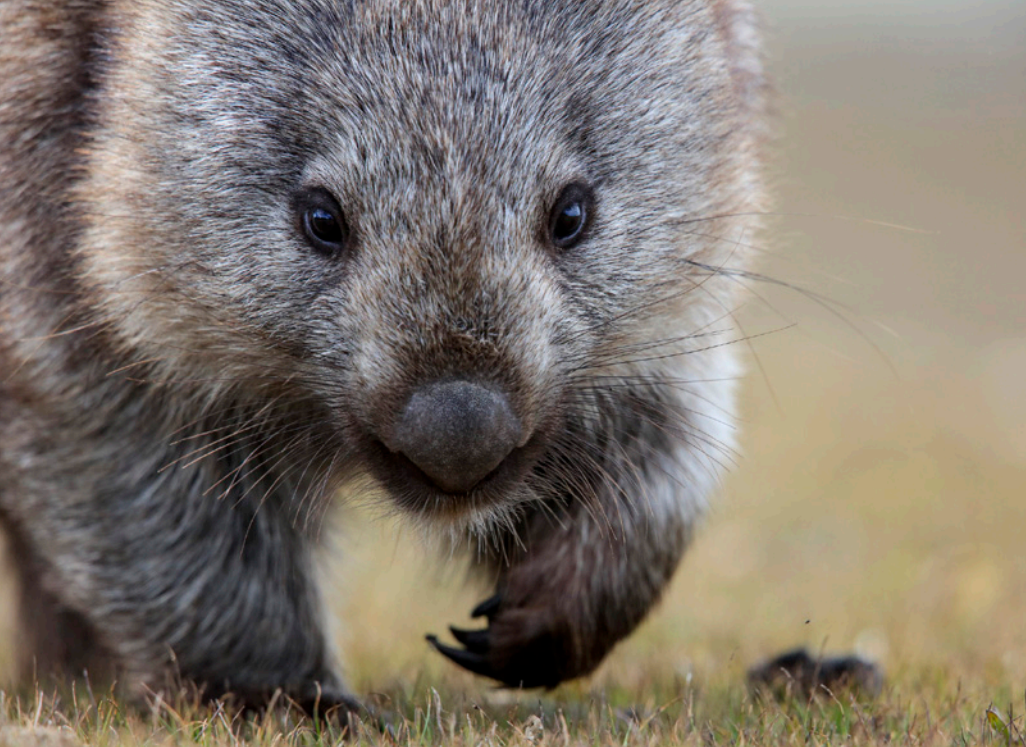
Common Wombat ( Vombatus ursinus tasmaniensis ), Vale of Belvoir Reserve.