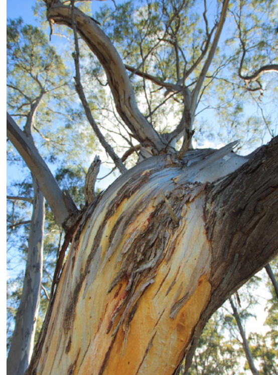
Silver peppermint ( Eucalyptus tenuiramis ).