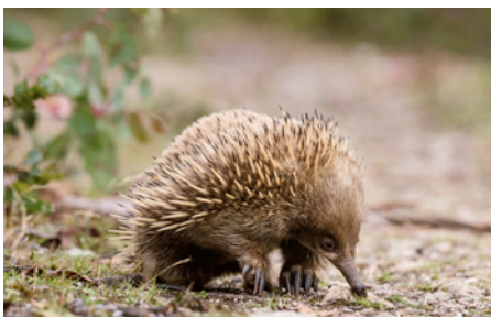
Echidna ( Tachyglossus a. setosus ) at Daisy Dell.