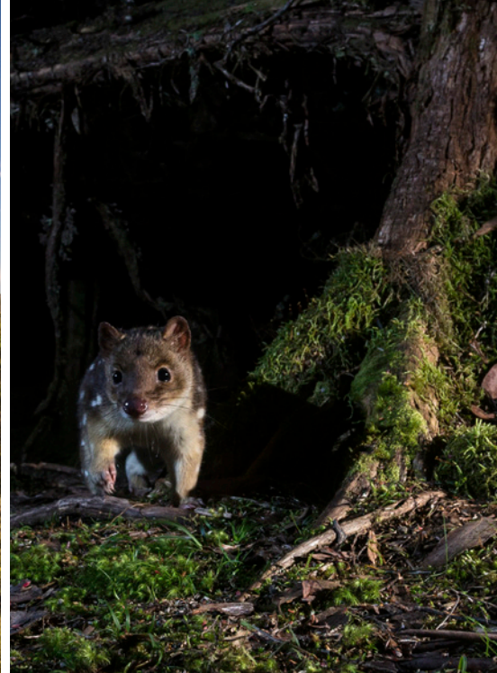
Spotted-tailed quoll ( Dasyurus maculatus ), Daisy Dell.

As we welcome the arrival of winter, Daisy Dell is transformed from a landscape of wildflowers and warm summer breezes to one boasting the first dustings of snow on the surrounding peaks of the Cradle Valley. With this comes the exciting prospect of what's yet to be revealed about this unique and beautiful place.