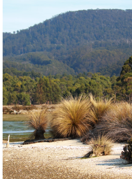
Saline grassland at Lutregala Marsh Reserve.

This 42 ha saltmarsh reserve, formed from a deep channel of the North West Bay River during the Pleistocene period, is rich in wildlife, especially invertebrates well adapted to its saline environment.