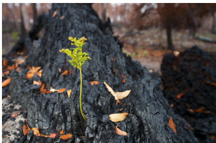
Post-fire discoveries.

Read the update on our Little Swanport campaign.