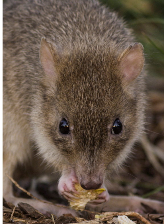
Tasmanian bettong ( Bettongia gaimardi ).

To become a Natural Guardian visit tasland.org.au/bequests-to-the-tlc