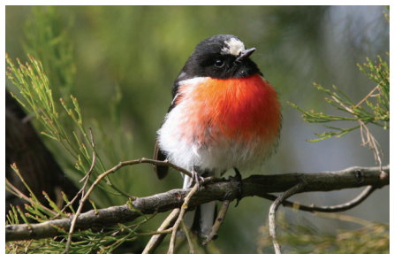
Scarlet robin ( Petroica boodang).

Discover how bushfires have affected the TLC's reserves.