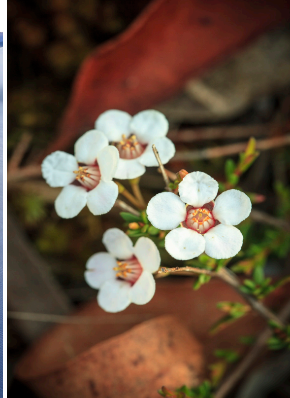
Tea tree ( Leptospermum sp).

Registration details and more information to come.