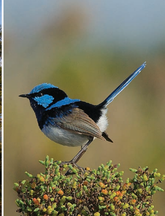
Superb fairy wren ( Malurus cyaneus).