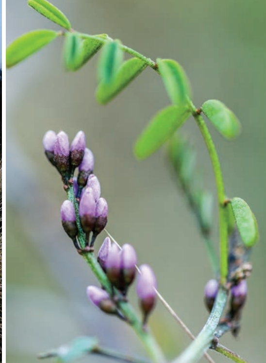
Native indigo ( Indigofera australis ).

While the TLC remains apolitical, we do advocate for strong protections of our natural values through legislative and planning mechanisms. To read our recent submission on the 10-year review of the Environment Protection and Biodiversity Conservation Act, and our position on the state-wide planning scheme and local council zoning reviews, see tasland.org.au/about-the-tlc/tlc-submissions/