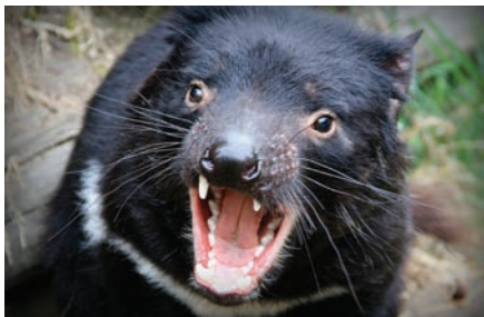
Tasmanian devil ( Sarcophilus harrisi ).