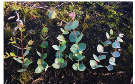
Cedar gum seedlings.

Read about Rubicon Sanctuary's first volunteer caretaker.