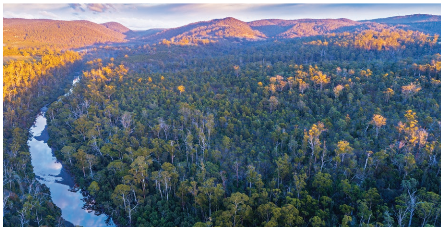
TLC's Little Swanport Reserve.

Read about Little Swanport and the TLC's suite of reserves at www.tasland.org.au/reserves