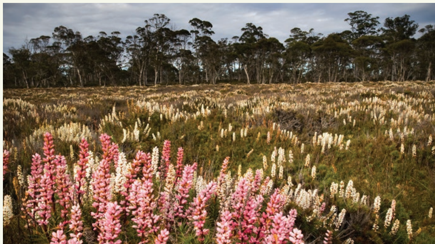
TLC's Skullbone Plains Reserve.

It is important, if you wish to specify a purpose, to express that you do not intend to create a legal obligation on TLC otherwise the TLC may be unable to accept or effectively use the gift.