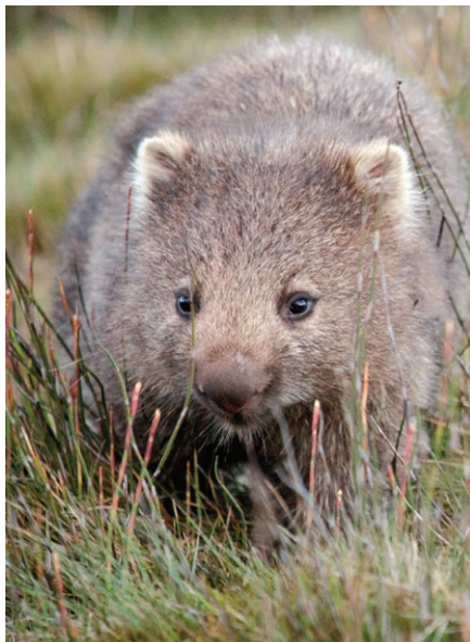
Common wombat ( Vombatus ursinus )

The objects and purposes which already bind the TLC provide a framework for the use of all funds and property we receive. Our focus on the perpetual protection and ongoing management of land of exceptional ecological value gives our supporters peace