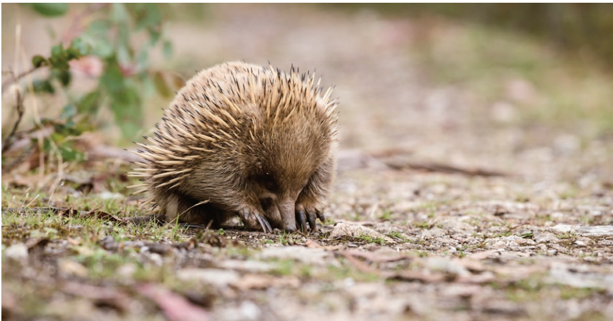
Echidna ( Tachyglossus aculeatus ).