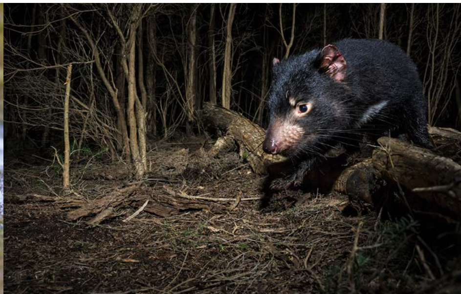
A flame robin extracts a meal (left) and a Tasmanian devil captured by a camera trap (above)