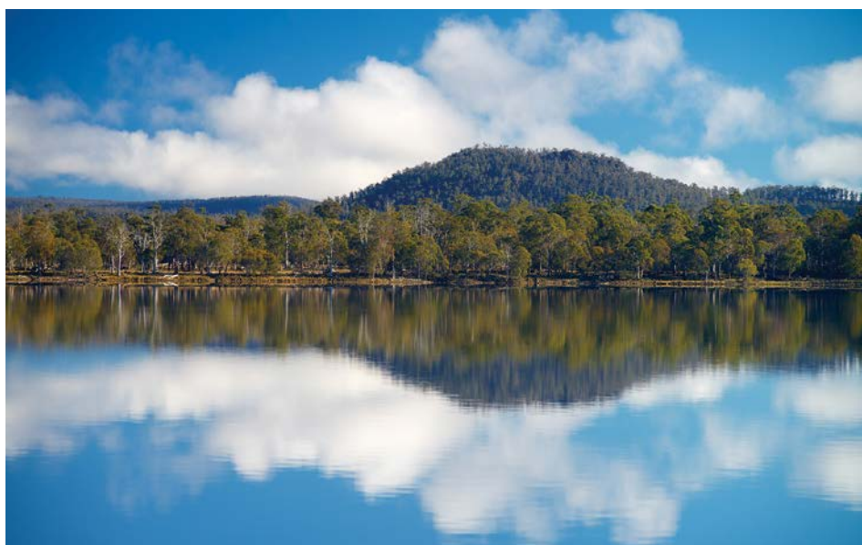
TLC's protected land at Silver Plains

The Tasmanian Land Conservancy, in partnership with the Tasmanian State Government's Department of Primary Industries, Parks, Water and Environment (DPIPWE), has been involved in the Protected Areas on Private Land program