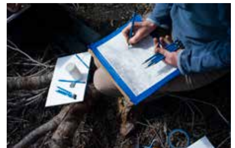
The artist at work.

Page 3 The wildlife on TLC reserves was showcased nationally as part of the ABC's Wildlife Spotter webpage, the 2016 National Science Week citizen science project.