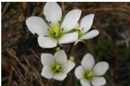
Tasmanian snowgiant ( Gentianella diemensis ).

Page 2 Find out about our new efforts to protect Daisy Dell, a highland property with a host of threatened and rare flora.