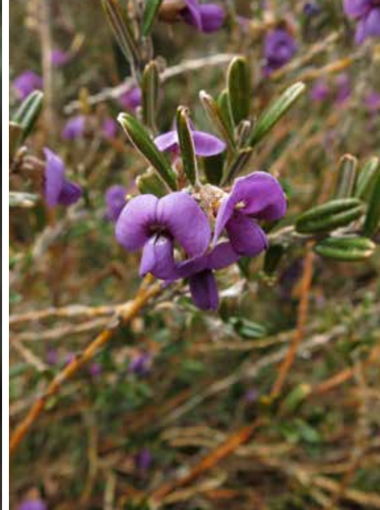
Mountain purplepea ( Hovea montana)

We also urge you to consider a contribution to Daisy Dell as a Christmas gift for friends or family. It saves on shopping, wrapping and helps to save an amazing part of Tasmania! We will organise for a beautiful Daisy Dell card to be sent on your behalf.