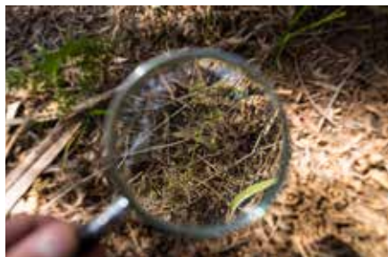
Taking close look at nature.

Page 2 Find out about our new efforts to protect Daisy Dell, a highland property with a host of threatened and rare flora.