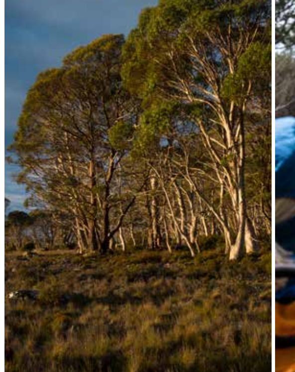
Five Rivers Reserve.